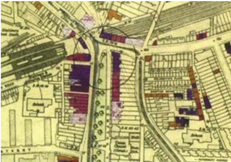
Extent of V1 Blast Damage at Highbury Corner, June 27, 1944.