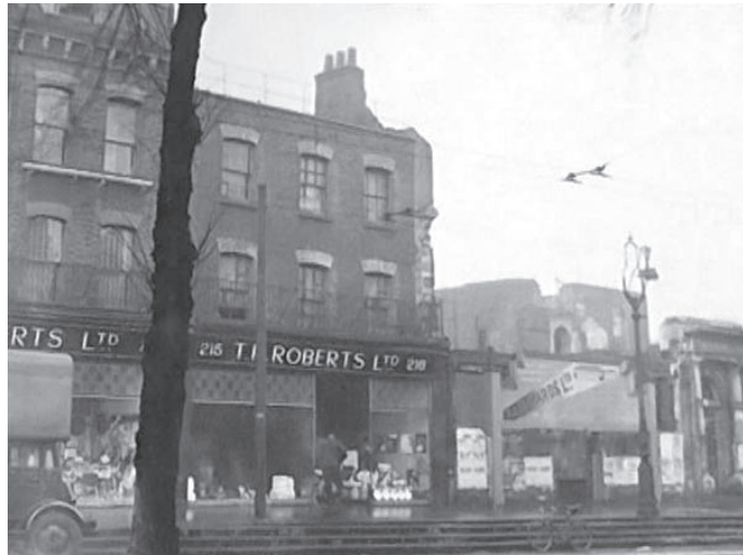
Remains of T.R. Roberts Ltd., Upper Street, 1940s.