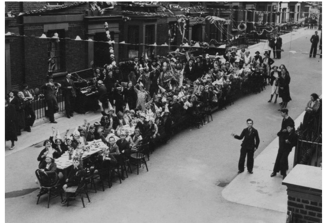
Liverpool Buildings, George VI Coronation, 1937.