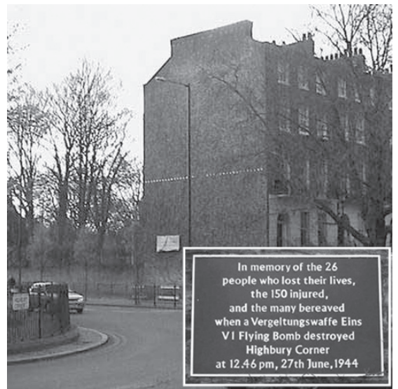
Commemorative Plaque, 1970s.