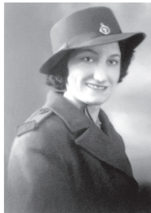
Mum Dressed in the Uniform of the Women's Land Army during the Second World War.