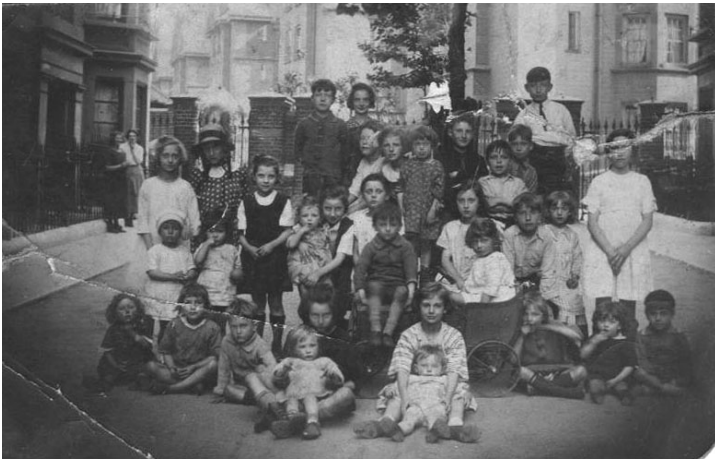
Bottom Avenue, Liverpool Buildings, pre-1939.