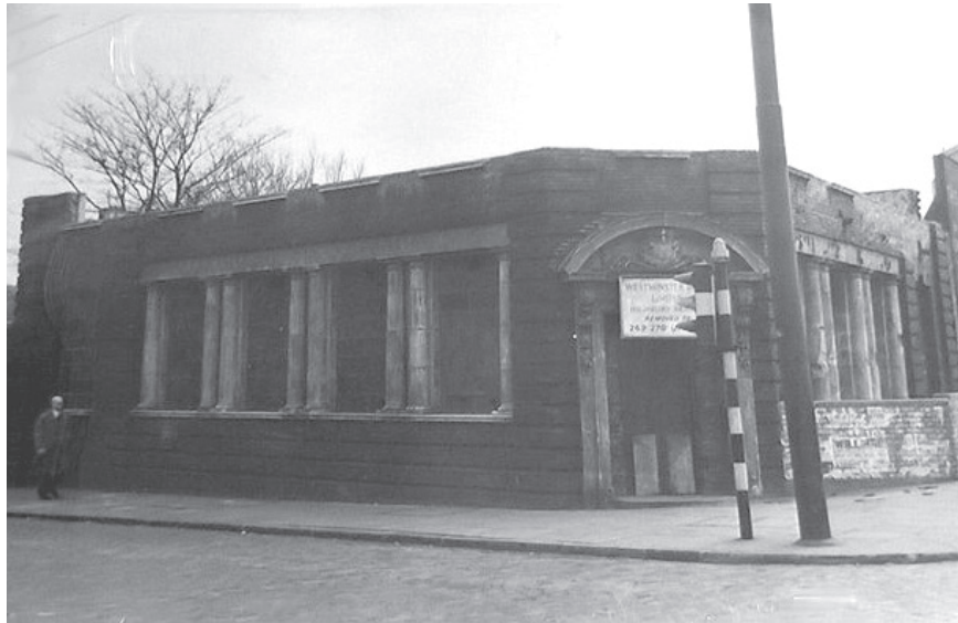
Remains of the Westminster Bank, Highbury Corner, 1950s.