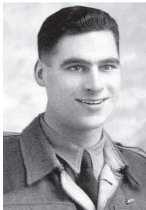
Dad Dressed in the Uniform of the R.A.F. Regiment and Showing his oak leaf MID Insignia.